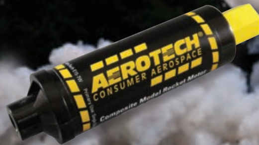
See back for motor specifications.

Real Rocket Motors with Real Rocket Propellant